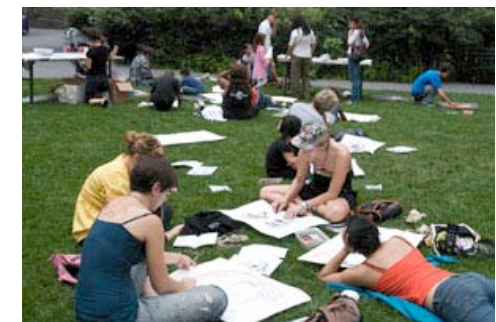
6: The Big Draw 2008, part of the River To River Festival. Project by artist Larry Dobens in Battery Park City Parks Conservancy's Teardrop Park. September 6, 2008.