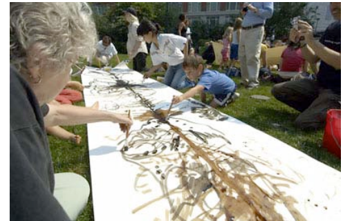
3: The Big Draw 2006, part of the River To River Festival. Rorschach ink drawing project by artists Larry Dobens and Ellen Driscoll at Battery Park City Parks Conservancy's Teardrop Park. September 9, 2006.